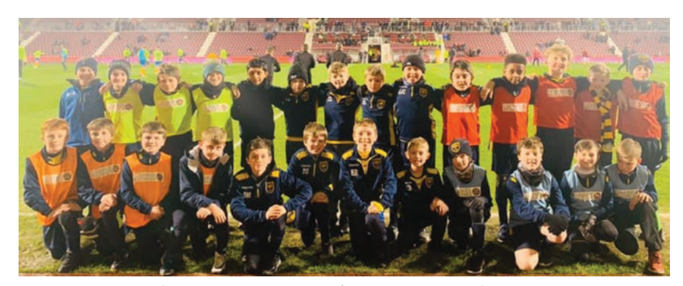
Cramond FC's 2009s team during a 'Half - time heroes' session at Hearts.